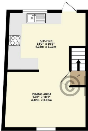
LOWER GROUND FLOOR 285 sq.ft. (26.5 sq.m.) approx.